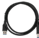
USB 3.0 (Standard-A to Standard-B) cable