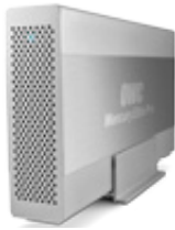
Mercury Elite Pro (with vertical stand)