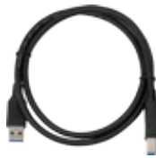
USB 3.0 (A to Standard-B) cable