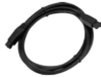
FireWire 800 (1394b) cable